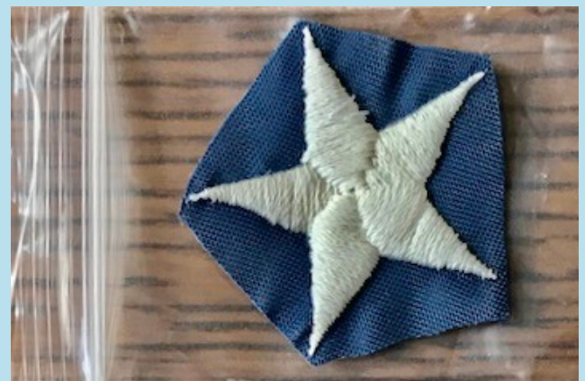
A retired American Flag Star packaged to send