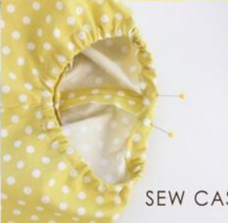
SEW CASINGS CLOSED