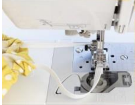
SEW ENDS TOGETHER